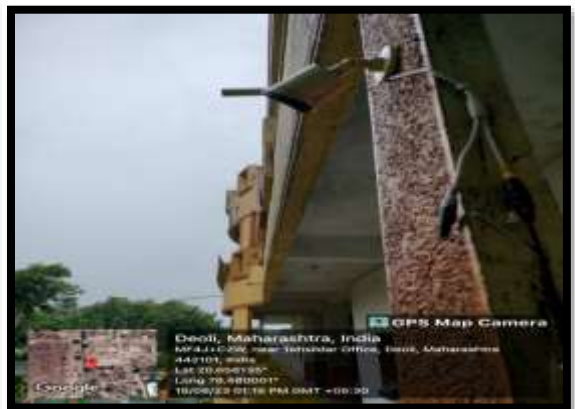
CCTV camera in corridor